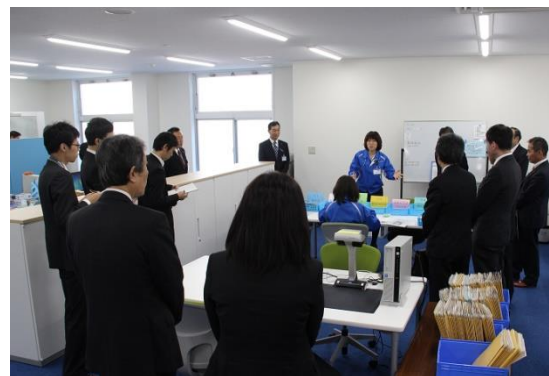
The tour of NHF